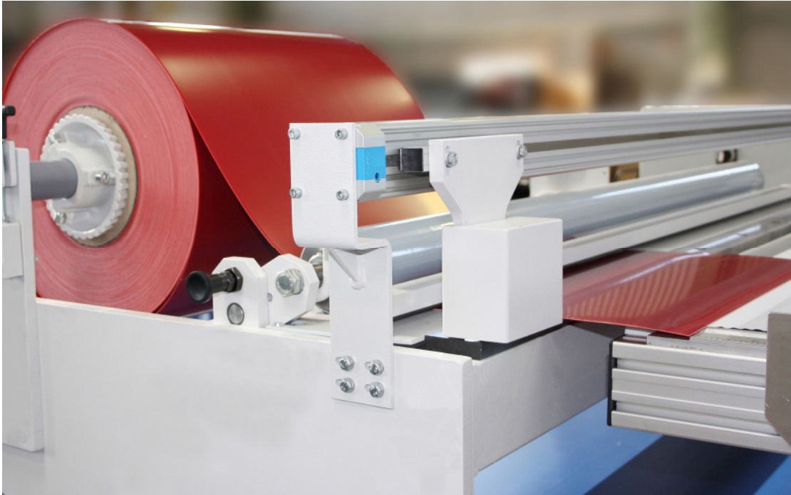
PUR Fig. 1

Premiere at the Ligna – the new highly-flexible and modular Buerkle PUR laminating line. The applications range from production of lightweight and composite panels to individual surface coatings of substrates with decorative foils, HPL, CPL and plastic foils especially for high-gloss solutions.